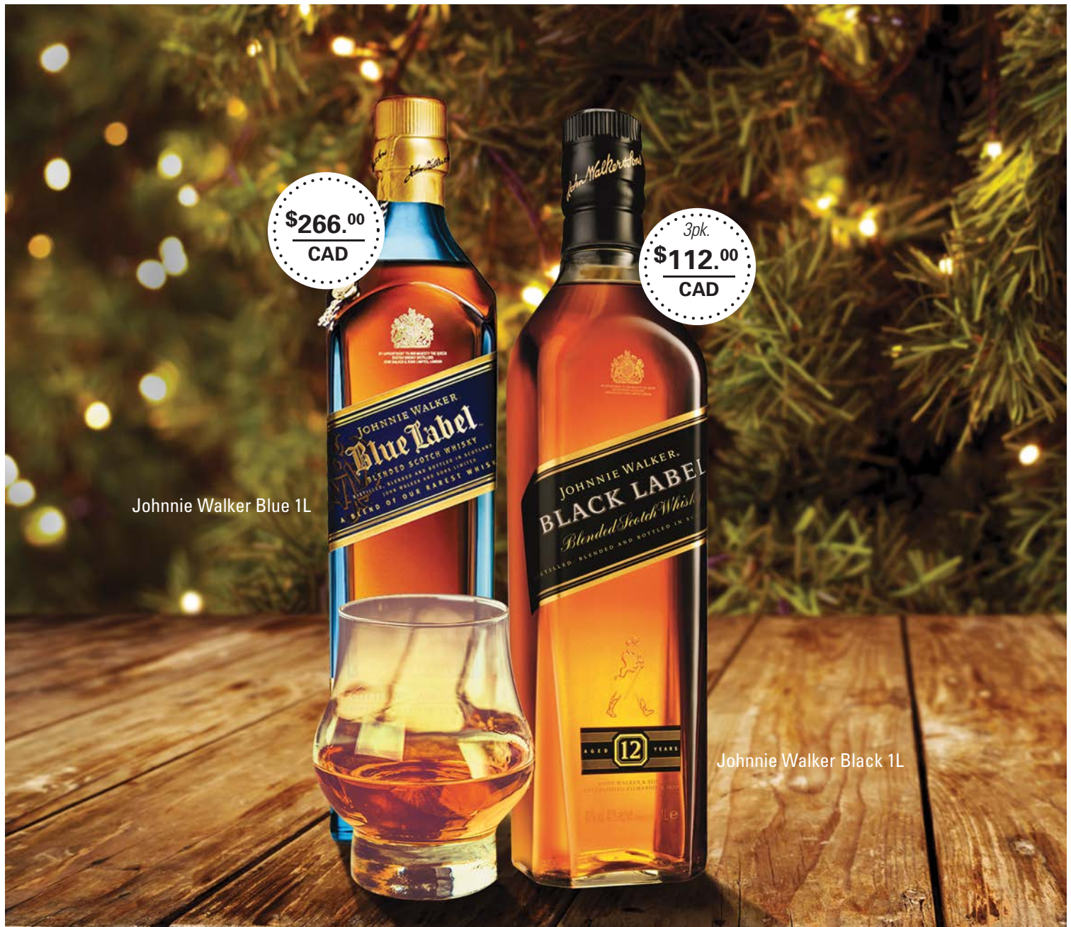
Johnnie Walker Blue 1L